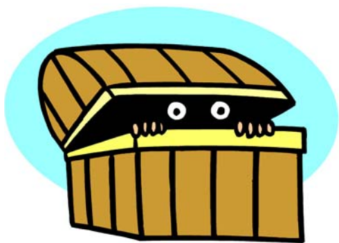
Some of the clip art used on this flyer was provided by Jupiterimages © 2007 Jupiterimages Corporation